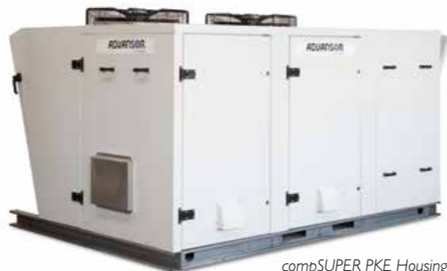
compSUPER PKE Housing (XS 3x2 VP)