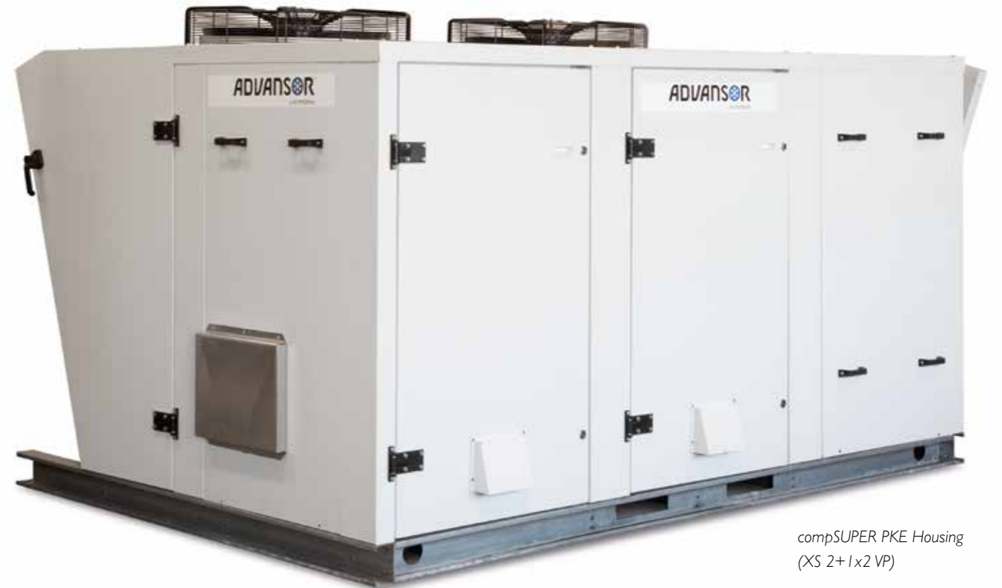
compSUPER PKE Housing (XS 2+1x2 VP)