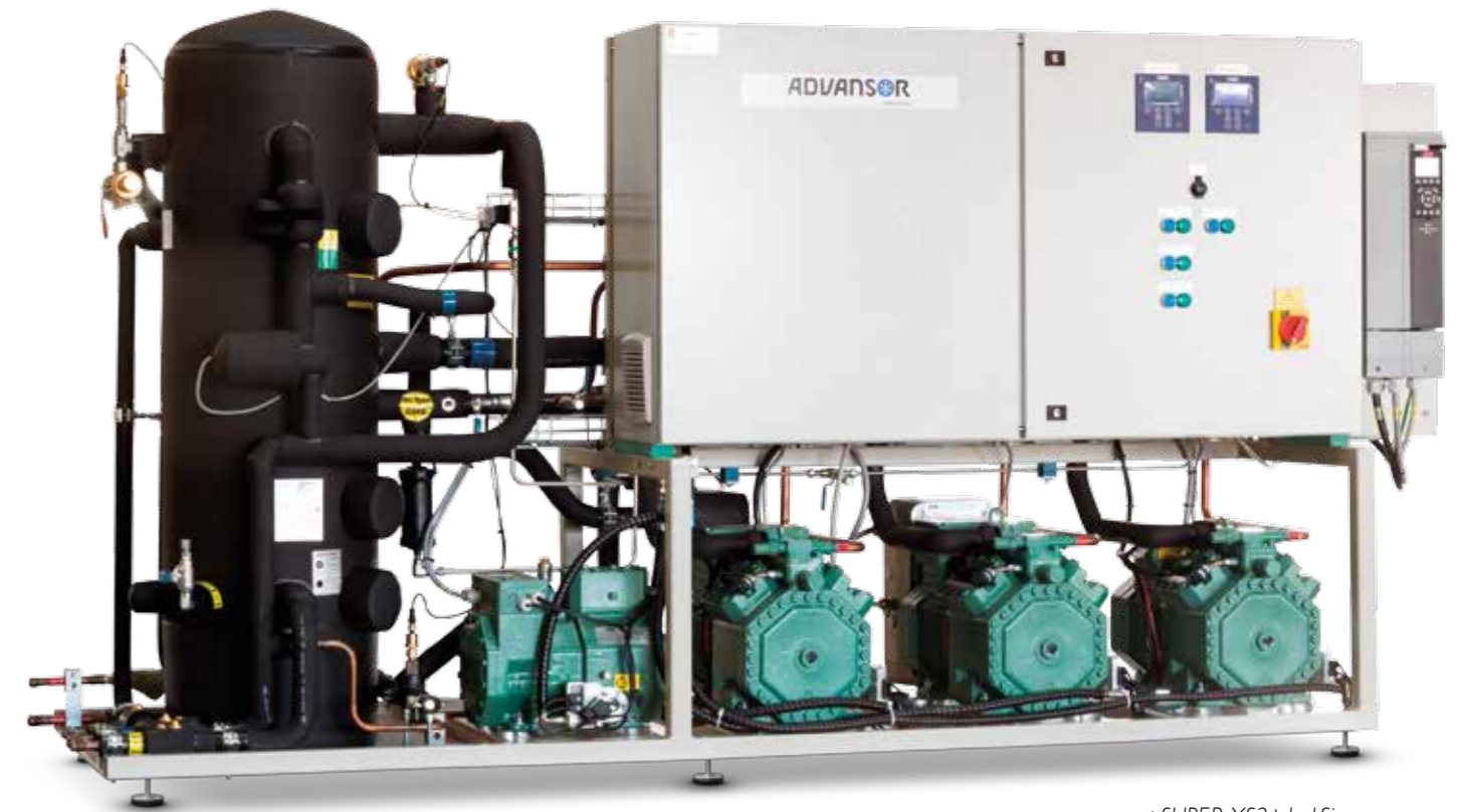
compSUPER XS2+1x1 Sigma